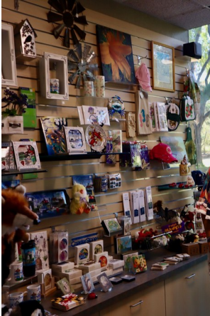
Tawes Garden Gift Shop