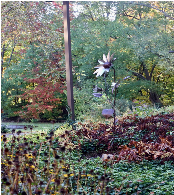
The new Tawes Garden sculpture, 'Black-Eyed Susan'