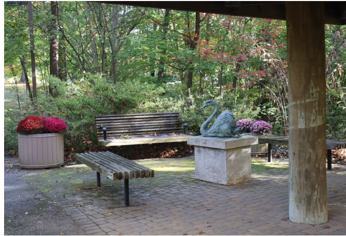
A beautiful day for a garden party