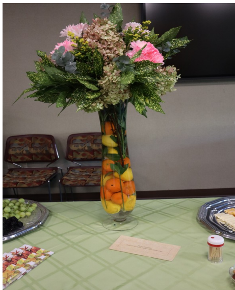
One of the gorgeous arrangements generously donated by local Garden Clubs