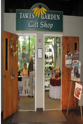
Tawes Garden Gift Shop